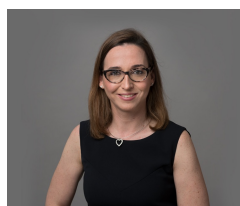
Elite Elkon Partner